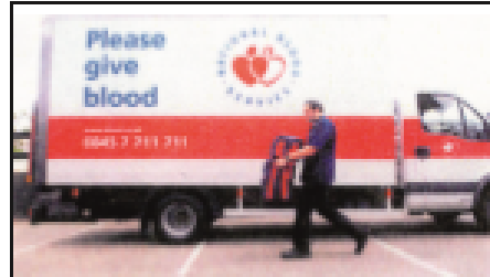
People in Norwich are being urged to give blood

This Christmas people in Norwich are being urged to give blood, as stocks have become low owing to the high numbers of people suffering from flu over the Christmas period. Shock new figures have today revealed that seasonal blood stocks are now so low that supplies of some blood types will only last hospitals across the region for four days.