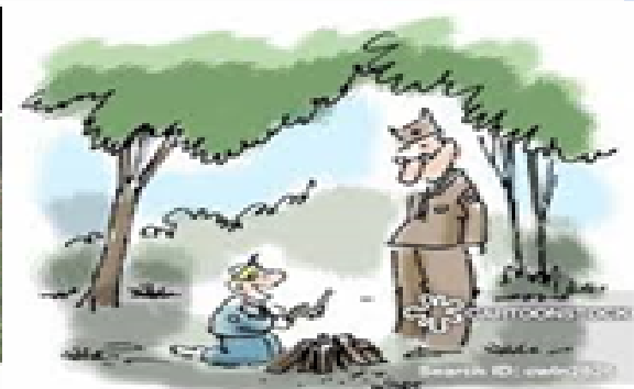
"Rubbing sticks together was a great idea. After 40 minutes, I'm so warm I don't need a fire!" have ANY information, PLEASE call: NO QUESTIONS ASKED