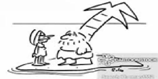
"What do you mean, you ate the survival manual?"