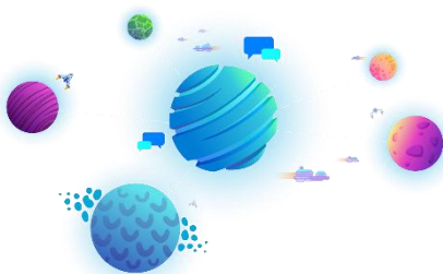
INTERACTING & COLLABORATING